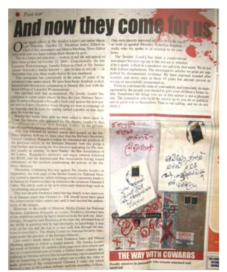
Sunday Leader front page of October 25, depicting the red-spattered threat received for publishing a story on alleged summary executions by the Sri Lankan army

However, international civil society groups are campaigning for a credible process of accountability, with the support of multilateral bodies. The United Nations High Commissioner for Human Rights (UNHCHR)