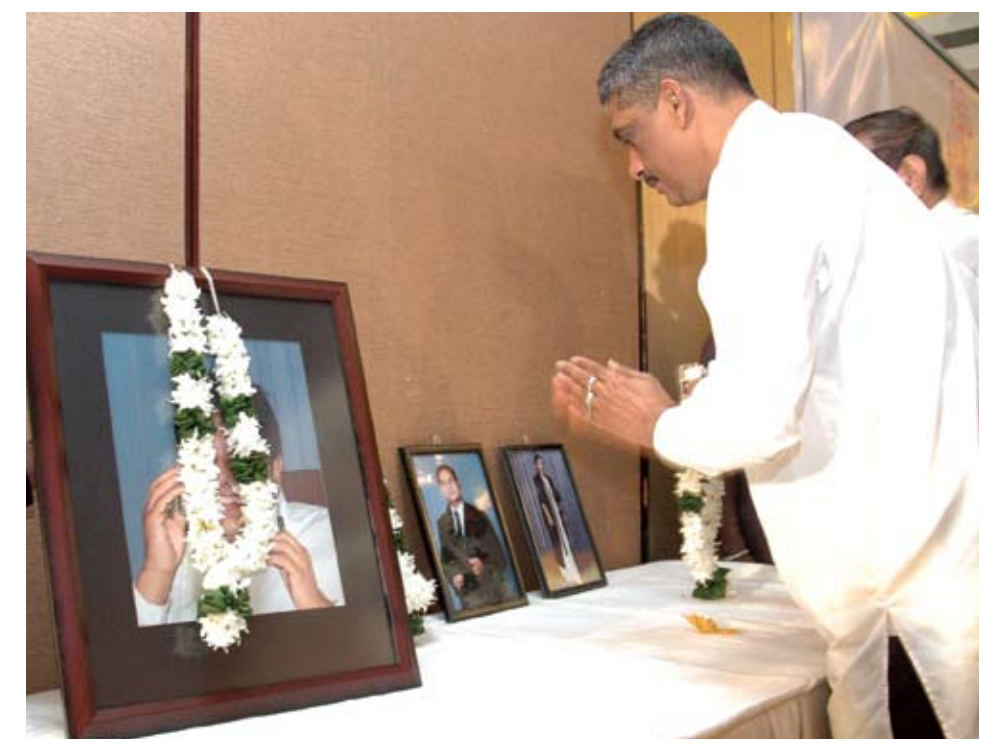
Sarath Fonseka, opposition presidential candidate and former army commander, pays homage to a garlanded portrait of the slain journalist, Lasantha Wickramatunge

General Sarath Fonseka's expressions of disquiet at the course the GoSL was taking after the war were grist for several media reports. The first report indicating a rift between the general who