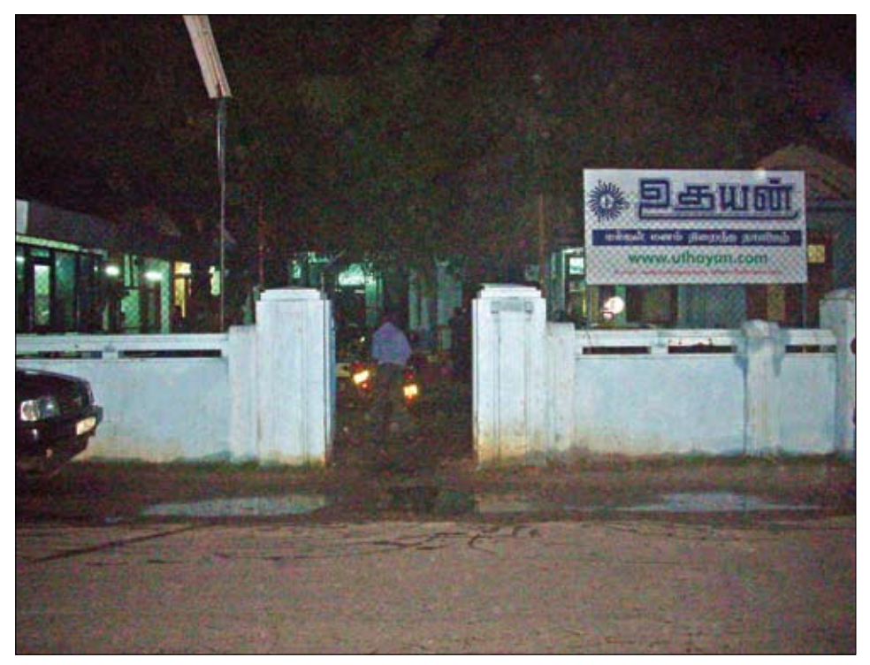
Uthayan office in Jaffna as journalists arrive late-evening to file their stories

On June 27, all Uthayan staff and news agents received letters purporting to be a "final warning", accusing the newspaper of "pro-terrorist" bias and "confusing" the Tamil people of Sri Lanka. With "harmony and liberty" now purportedly regained in Sri Lanka, Uthayan was working toward "destroying the permanent peace and (causing) the public to turn