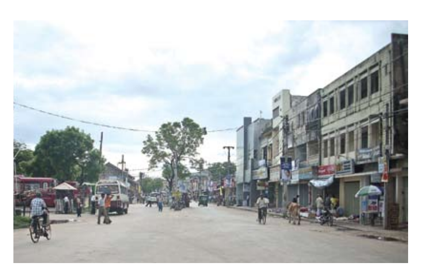
Jaffna'smainstreetbearsallsignsofacityyettorecoverfromthebitterlegacyofaquarter-centurylong civil war

Stakeholders in the media should at the same time commit themselves to providing journalists, especially those in the provinces, with a fair deal. Collective agreements between managements and workers in all media organisations should be concluded to provide for stability and security in employment conditions. Structures of self-regulation and accountability toward the media audience should be strengthened. The media should aim to speak for all Sri Lanka's ethnic communities, rather than cater to their narrow constituencies of advertisers and readers.